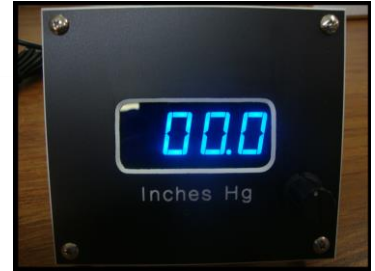
Medical Aspiration Controller for Liposuction Procedures (Model 460)

The Aspiration Vacuum Controller for medical use is just one example of the many products that DigiVac has designed, developed and delivered to our client base.